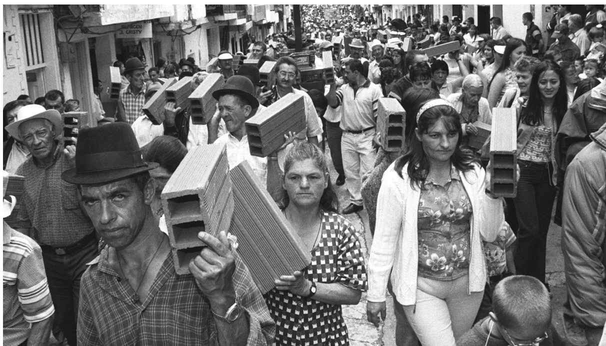
📷 Ten months after the FARC guerrilla's armed takeover destroyed close to 250 homes and left 5 policemen and 18 civilians dead, the people, with the support of the government of Antioquia, participated in a brick march to reconstruct the town. Granada, October 2001.

This report is a moment and a voice among a packed audience undertaking multiple dialogues of memory over the past decades. It is the "Basta ya!" which emanates from a society that is overwhelmed by its past, but is striving to build a new future.