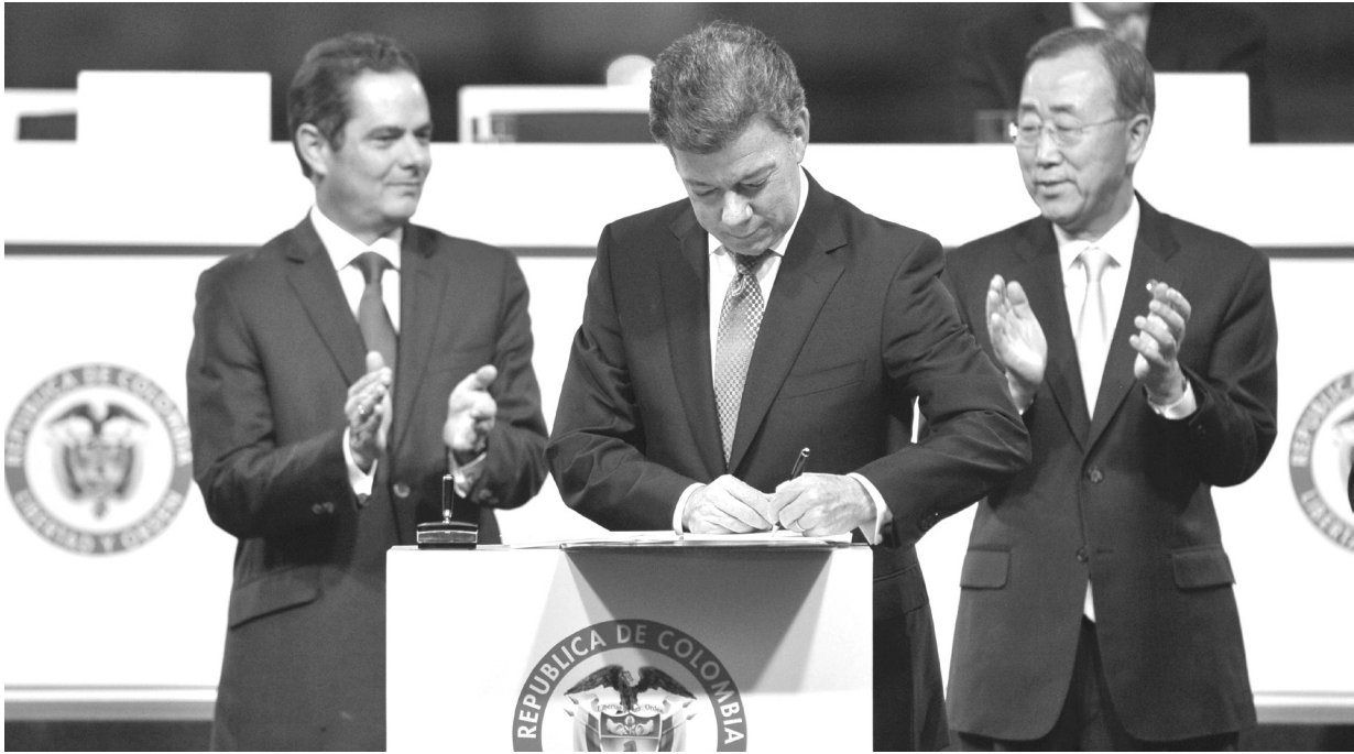
📷 Signing the Victims' Law before the Secretary General of the United Nations. Casa de Nariño, Bogotá – June 10, 2011.

and human rights organizations – and State bodies which have the required authority, autonomy and resources to advance their efforts to reconstruct memory in order to secure the realization of the right to the truth which the victims and society as a whole deserve. 31