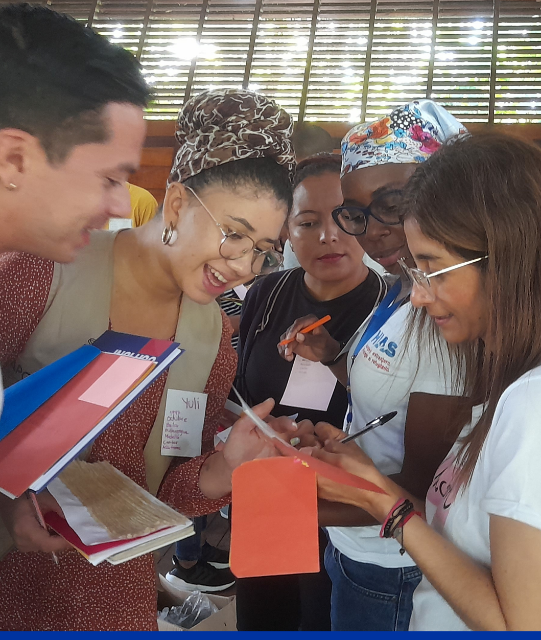
Group exercise under the framework of the care strategy for humanitarian workers. Necoclí, Antioquia.

Under the framework of the first collective care session for humanitarian workers that assist refugees, migrants, and host populations in Necoclí, participants performed individual and self-reflective exercises, and also engaged in group activities on collective construction. This strengthened self-recognition and recognizing others, increased awareness on the importance of self-care and care for others, and consolidated bonds of trust.