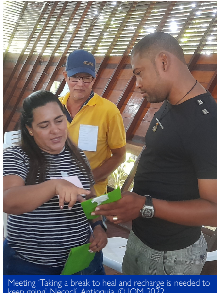
Meeting 'Taking a break to heal and recharge is needed to keep going'. Necoclí, Antioquia.

Humanitarian workers from E.S.E. Hospital San Sebastián de Urabá, the Colombian Institute of Tropical Medicine, Apoyar, HIAS, Red Cross and the IOM participated in this strategy.