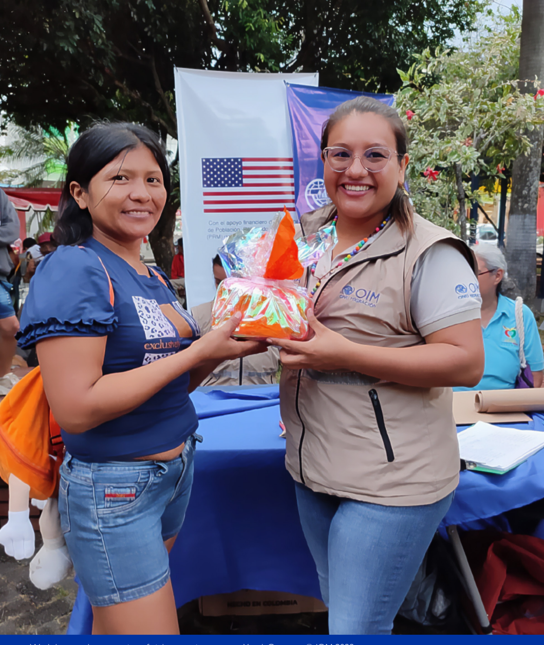
Workshop on the prevention of violence against women. Yopal, Casanare.

Under the framework of the International Day for the Elimination of Violence Against Women, commemorated on November 25, we assisted the Community Health Network 'Unidos Somos Más' from Yopal, Casanare, with the workshop "You are not alone, report, We are free!" A space that promotes actions to prevent and mitigate gender-based violence within their communities.