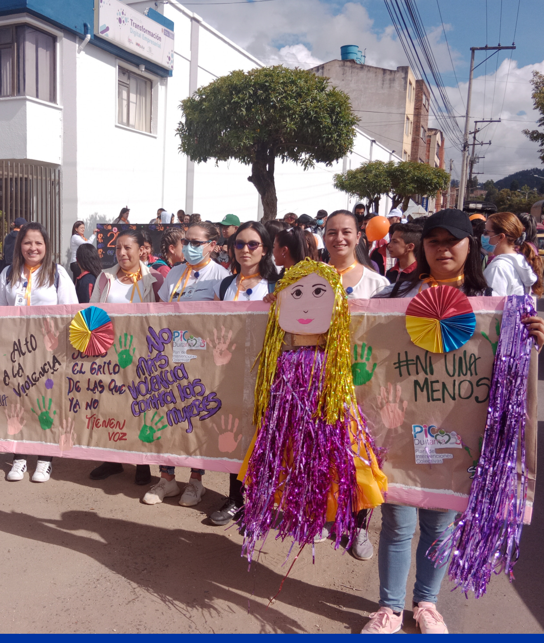
Rally under the framework of the 16 Days of Activism. Duitama, Boyacá.

In coordination with municipal health authorities and other partners, together with the Community Health Network 'Parche sin Fronteras' from Duitama, Boyacá, we developed social mobilisation actions that sought to raise awareness on the need to end violence against women. To this end, more than 250 women walked through the municipality's main roads displaying key prevention messages.