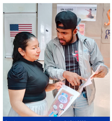
Suicide prevention event. Bogotá.

Under the framework of the World Suicide Prevention Day, commemorated on September 10, 373 Venezuelan and Colombian nationals participated in awareness-raising activities conducted by the 'Construyendo Sueños' Community Health Network on topics related to the elimination of stigma and the promotion of care pathways to address suicide. This effective action was possible because of the capacity building the IOM provided to this network.