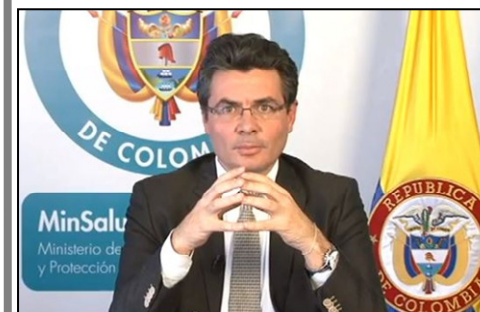
Video message of Minister of Health Alejandro Gaviria to the teams in charge of implementing PAPSIVI http://www.youtube.com/watch?v=5c1-G6NT8k

Victims reparation services - especially psychosocial and integral health services - are essential to create conditions for a post conflict scenario in Colombia". Minister of Health Alejandro Gaviria