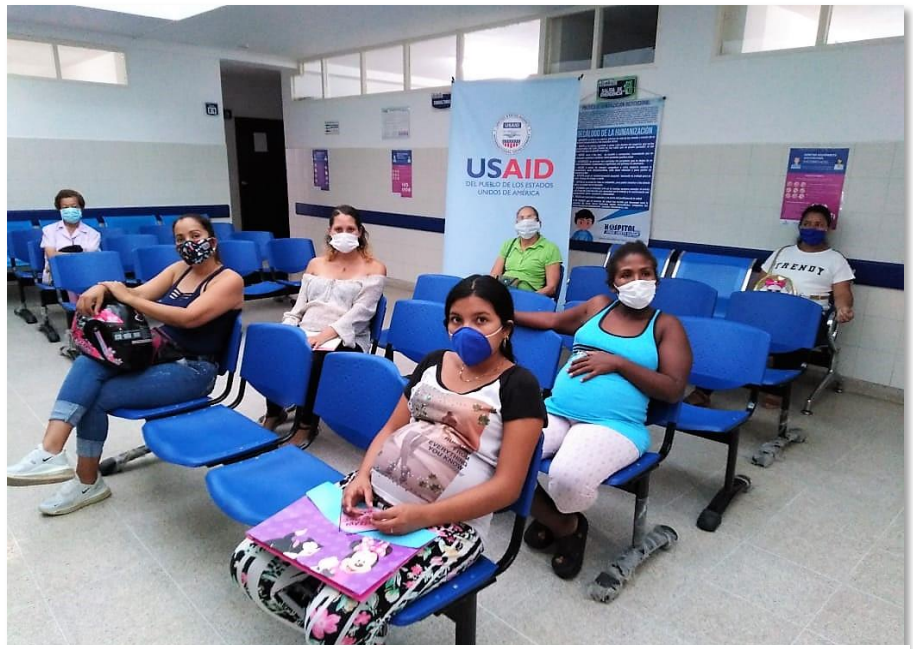
Atención prioritaria a madres gestantes con protocolo COVID-19, Villa del Rosario, Norte de Santander

Support for active surveillance, including health exams, referrals and data collection in POE through the hiring of support personnel for the Urgent and Emergency Regulations Centers (CRUE in Spanish) in Norte de Santander and Nariño.