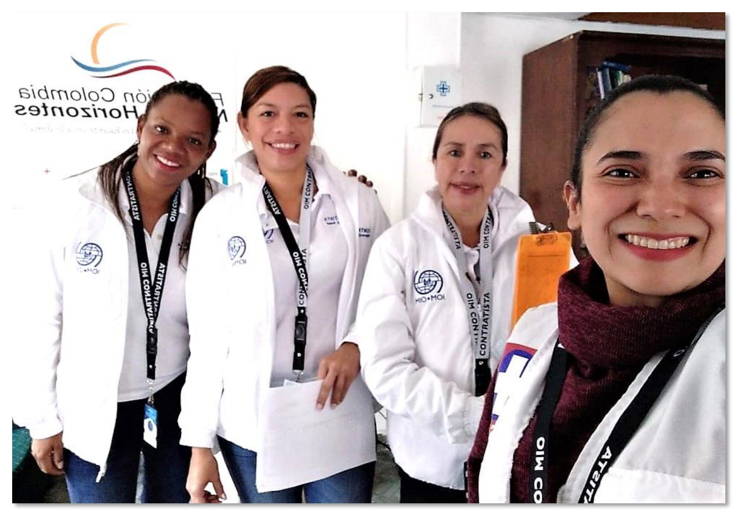
M&S-IOM Territorial Health Team, Cundinamarca