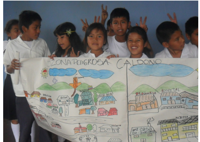
Mapping exercise in Cauca

As part of this program, the Vulnerability, Risk and Opportunity Mapping (MVRO) methodology was developed to support local-level, sustainable solutions to the recruitment and use of children and adolescents.