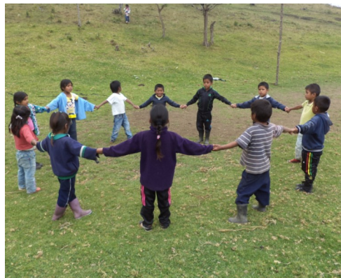
Mapping exercise in Cauca