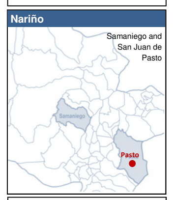
R2. Held a training session for PAPSIVI inter-disciplinary teams