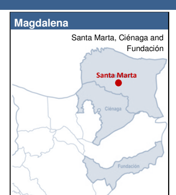
R1. Supported the design and adjustment of Santa Marta's Local Action Plan (PAT) with the participation of more than 40 victims representatives