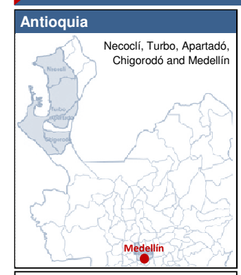
R4. Conducted community strengthening and decision making workshop with afro descendant authorities