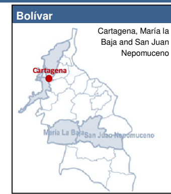
R1. Supported the election and assembly of Cartagena's Victims Roundtable

National / R2. Held a training session for PAPSIVI inter-disciplinary teams