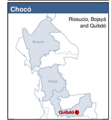
R4. Conducted a strengthening workshop with afro descendant communities on the Victims Law. decree 4635 (afro descendant services) and the participation protocol in Bojayá, Quibdó and