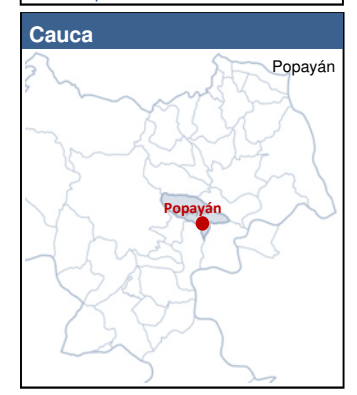
R1. Supported the SNARIV in the field Cauca session to coordinate available victims services

La Guajira / R3. Supported a CNMH workshop with local teachers to collect tools to guide the Historical Memory Center's teacher toolbox